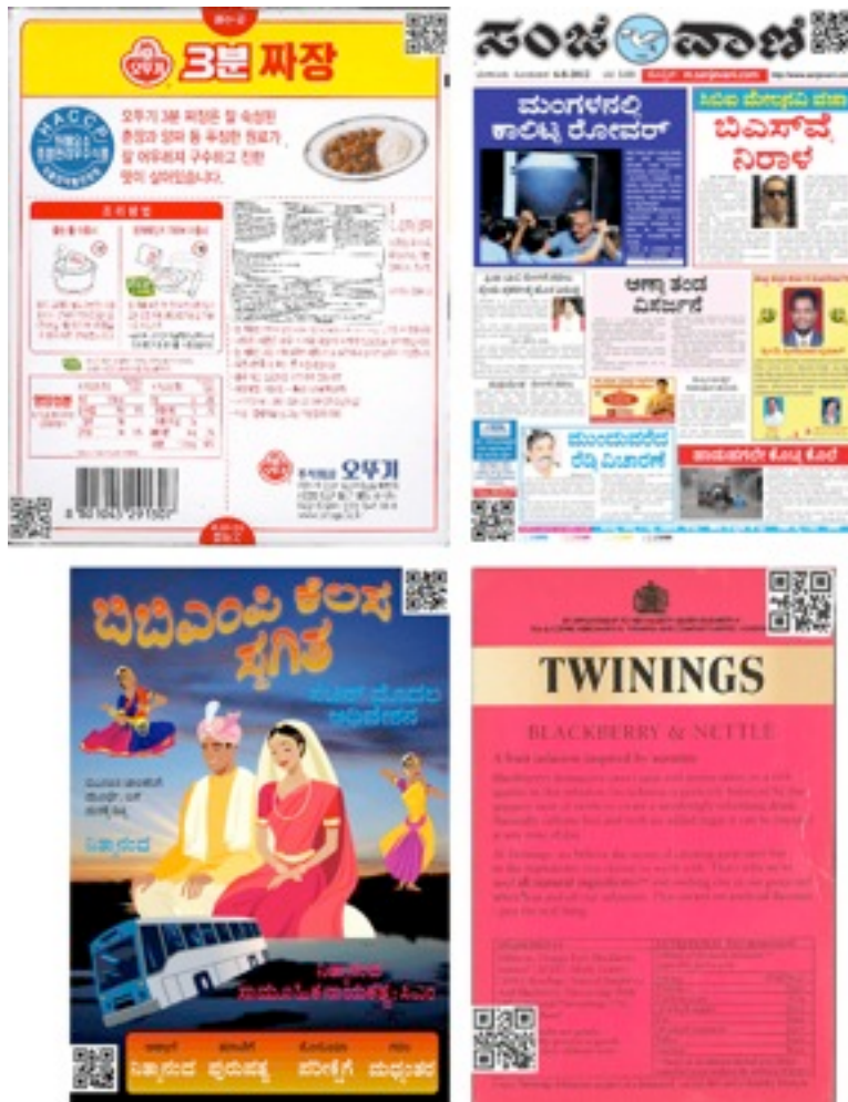
Figure 2. Example AudioCanvas media. Clockwise, from top left: curry packet; newspaper; box of tea; movie poster.

AudioCanvas affords rich experiences with physical objects, allowing any marked-up item to become a touch panel to interact with remote audio resources (see Fig. 1). Our approach uses two precisely placed QR codes on printed media to support detection of the position of the user's selections on their photo of an item. To interact with the system, the user first positions their phone to take a photo of an item. When both codes are detected, a photo is taken automatically, and the phone dials a voice service in the background. Selecting any region on the photo (with fingers on touchscreens or the joypad on a feature phone) passes the coordinates to the voice service, which plays back the appropriate audio immediately.