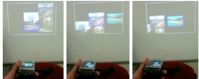
Figure 2: The prototype in use, showing a user selecting content (highlighted in blue) by pointing the device itself. Content remains stationary to allow easy selection of individual items.

Our prototype is implemented using a Nokia N95 mobile phone in conjunction with an Optoma PK-101 pico projector. Orientation and movement sensing is provided by an attached SHAKE SK6 bluetooth sensor pack [11]. The SK6 is a small integrated sensing device that provides range of sensing and feedback options. We use its internal pager-style motor to provide vibrotactile feedback, and