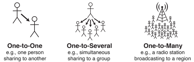
Figure 2. Sharing relationships possible with the ACQR technique.

In addition to 1-1 simulation, we also tested 1-many usage of the technique, following the same method but sharing to four phones simultaneously. Sharing 200 times (i.e., N = 800 ) at a mean ambient noise level of 65 dB, the accuracy was 96.25%.