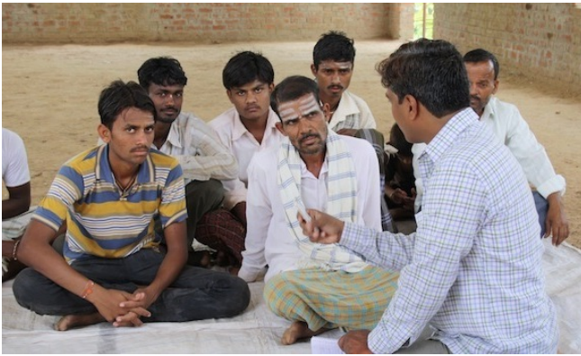
Figure 3. Conducting the Indian evaluation in Karnataka, India.

provide a worthwhile and practical solution. Comments made by participants about a potential sharing service included: “very helpful, 100 % useful – organic farming is a new trend and we want to share experiences and knowledge on it [the Spoken Web],” “this is [an] extremely useful medium where we can share with another very fast,” and “I am confident that if you launch such a thing it will be a success across India.”